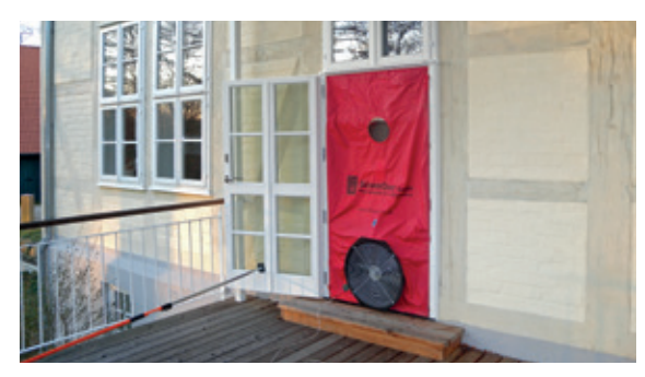
BlowerDoor measurement in the context of an energetic renovation