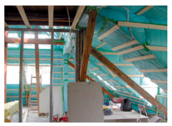
The air barrier is still visible (sheets and wood panels): This is the optimum time for a BlowerDoor measurement.

the valid standards (EN 13829, ISO 9972). Via the BlowerDoor fan, air is continuously sucked out of the building, so that an imperceptible negative pressure of 50 Pascal is generated within the building. Occupants can remain in the building during the measurement without experiencing any discomfort. If there are leakages in the building envelope, outside air will infiltrate the building through them. During the walkaround, the building is carefully inspected for air flows which are located by means of an anemometer or via IR thermography.