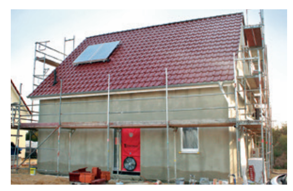
BlowerDoor test of a new single-family home

A building is considered airtight when the air in the building under testing conditions is not exchanged more than three times per hour. In a building equipped with a ventilation system, the air change at testing pressure cannot exceed 1.5 times per hour. "Airtight" thus does not mean completely sealing a building, but rather avoiding undesired leakages in the building envelope. This is important because warm air flowing out through the joints costs energy. At the same time, the warm air transports moisture. It cools at the outside wall of the building and condenses. This condensation can cause severe structural damage. Outside air infiltrating the building through joints also transports allergens from the insulation and dust particles into the house, which can lead to ill effects on the occupants' health.