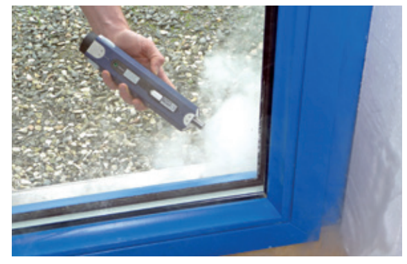
Leakage detection with the fog generator BlowerDoor HandFogger

Construction-related leakages or permeability often occur at connections and penetrations. When planning an air barrier, these areas should be given careful consideration to avoid costly rework later.