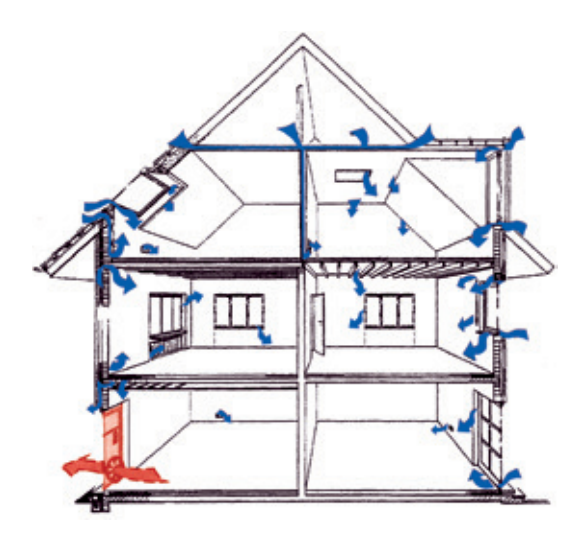
The measuring principle: A fan draws the air out of the building. Outside air flows into the building through any leaks.

The Minneapolis BlowerDoor has been used for air tightness measurements in Germany since 1989 and is today one of the most successful testing devices for air tightness worldwide. IR thermography during the BlowerDoor measurement optimally completes the test of the building envelope, delivering comprehensive results and conducive evidence of the condition of the building envelope. These conclusions are illustrated and documented within the quality assurance process.