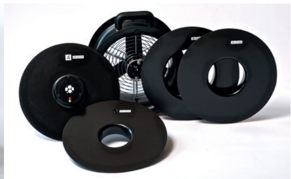
BlowerDoor flow rings until 1991 (left), BlowerDoor flow rings since 1992 (middle), set of flow rings BlowerDoor MiniFan since 2014 (right)