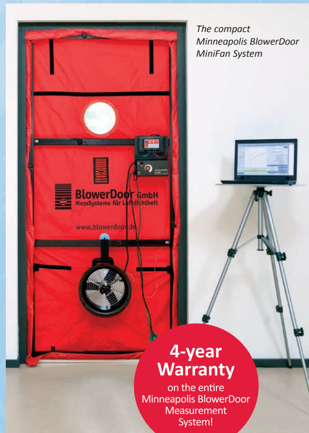
The compact Minneapolis BlowerDoor MiniFan System