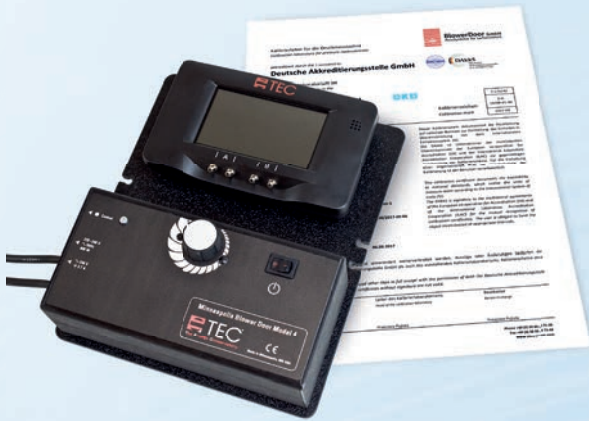
The digital pressure gauge DG-1000 inclusive high resolution touch screen, integrated WLAN module and firmware updates free of charge