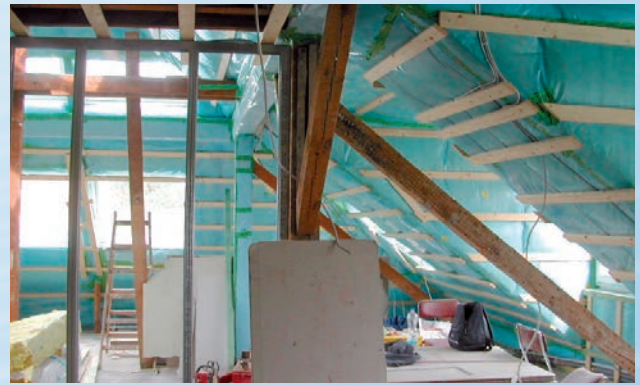
BlowerDoor test for quality assurance during construction

The calibration dates of the BlowerDoor measuring devices used are included in the test log, providing important information on the high accuracy of the measuring technology. The TECTITE Express 5.1 software allows you to select 12 pressure stages for each measurement series. For unfavorable climatic conditions or specific building properties, the accuracy of the measurement can be increased further by entering up to 1,000 measuring points per pressure stage. Each measurement series also includes the interior and exterior temperature as well as the corresponding air pressure.